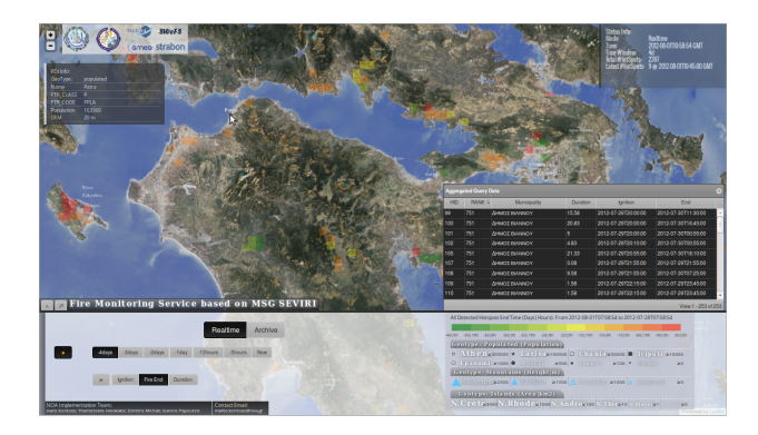
Fig. 2. The NOA fire monitoring application GUI developed in project SWeFS

applied to any geographic area due to the generality of the used technologies (e.g., RDF, linked data, KML).