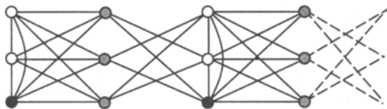
Fig. 3. Hard graph for Greedy in terms of average degree.

The end of the chain increases the average degree by roughly O(\ell^2/n) , which disappears into the lower-order term. \square